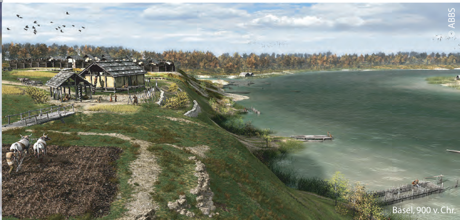
Basel, 900 v. Chr.

Contact: isbabasel14-ipna@unibas.ch More information: ipna.unibas.ch/archgen/isba14